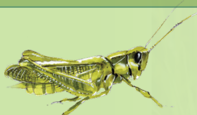
Grasshoppers & Crickets