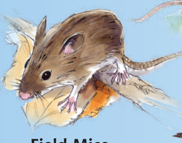
Field Mice & Voles