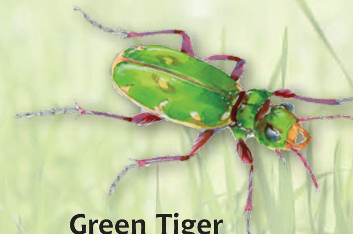
Green Tiger Beetle

There are 50 species of ant in the British Isles, some accidentally introduced from overseas. All ants 'milk' aphids of their sweet secretion called honeydew. Most of the ants seen are infertile female workers. Many species can bite but only some can sting. Only males (drones) and queens have wings, which are used just once during mating, after which the males die.