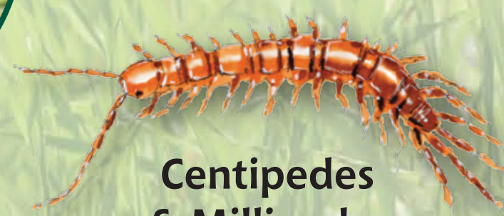
Centipedes & Millipedes